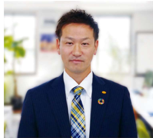
President & CEO

Since our establishment in August 2009, we have kept it important to prioritize the connection with our customers. With aims to “becoming the company which provides ‘realization’ that enriches the future of the people and the society,” we would like to continuously transform through challenges and changes in order to become the best solution provider. By spreading the usage of renewable energy, we will continuously commit to contribute towards solving environmental issues.